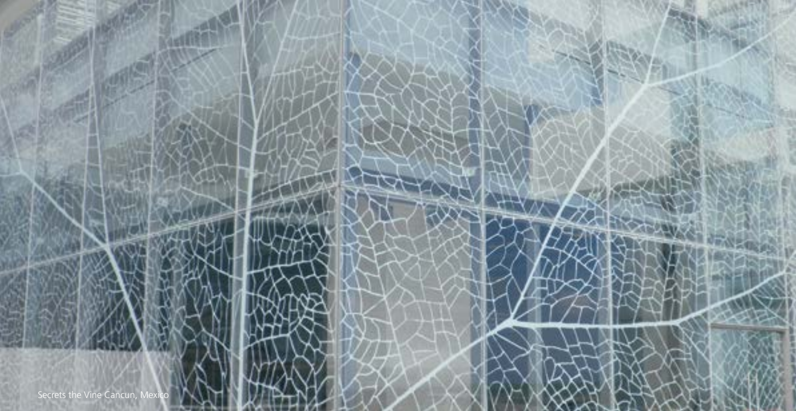
Secrets the Vine Cancun, Mexico