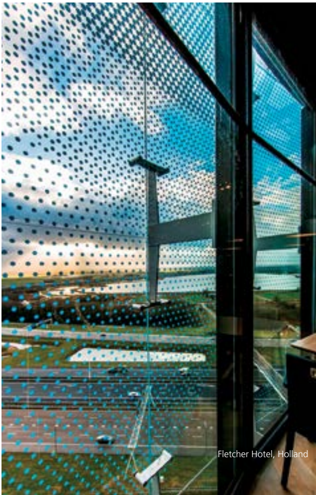
Fletcher Hotel, Holland

Industry leading 720 dpi results in superior print resolution