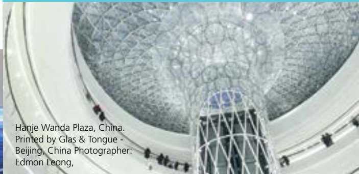
Hanje Wanda Plaza, China. Printed by Glas & Tongue - Beijing, China