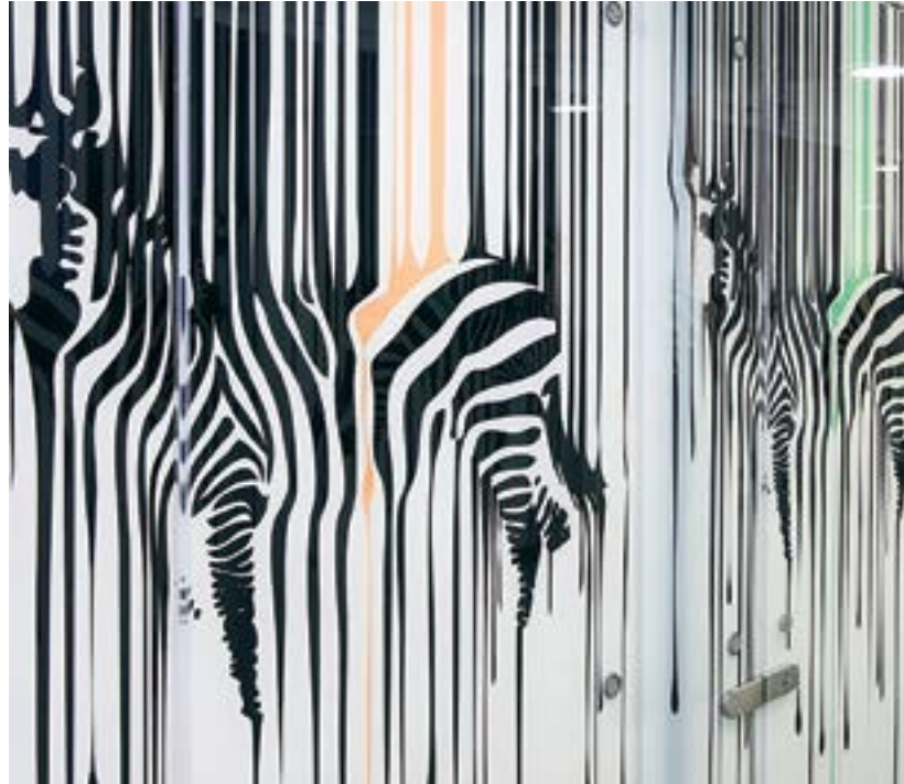
Printed by Spiral